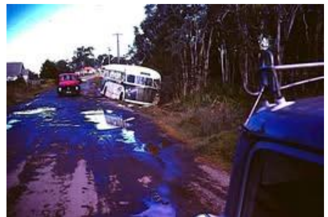
B&W bus bogged Queens Parade, Brighton - c1961