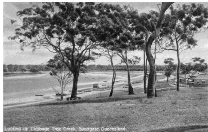
Cabbage Creek c1905