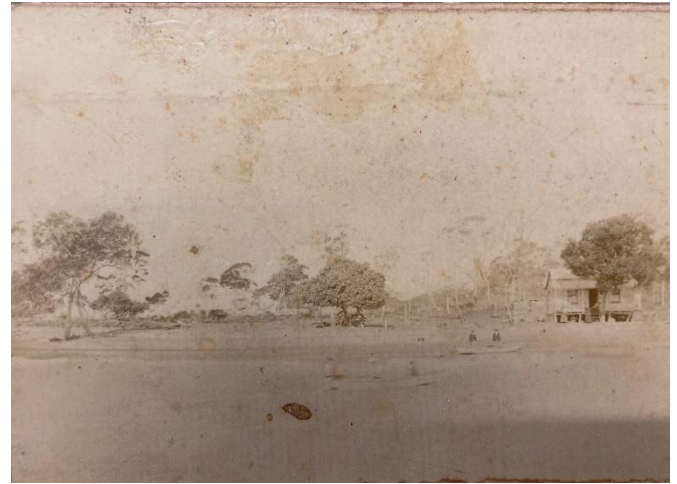
Lihou family house

The railway line was clear from Sandgate to Albion, the waters in Cabbage Tree, Nudgee, and Downfall Creeks having greatly subsided. At the Albion it was within a few inches of the bridge and rising at the rate of 6in. to 8in per hour.”