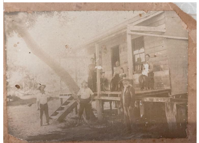
Lihou family house