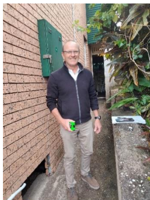
MORETON BAY DESIGNS Designs for Queenslanders